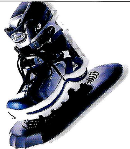
Bigfoot Hike up a snow-covered mountain with K2's Vert snowshoes, $160, and keep your paws dry in Nitro's Aura snowboarding boots, $289.