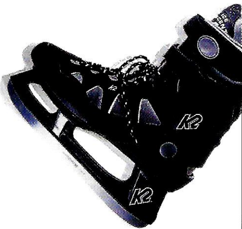
Blade runner Carve a groove on the rink with K2 Skates' Ice Ascent skates, $150.